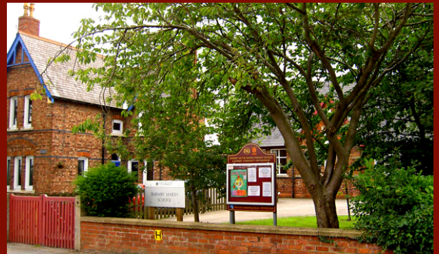
Barmby on the Marsh Primary School