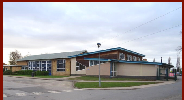
Barlby High School