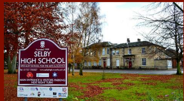
Selby High School Specialist School For The Arts and Sciences