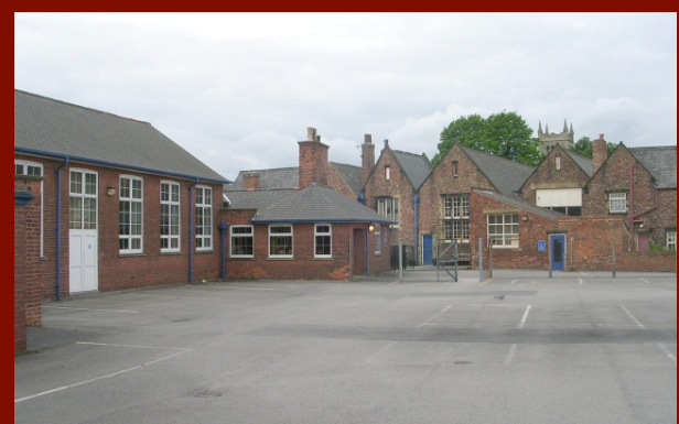
Selby Abbey C of E Primary School