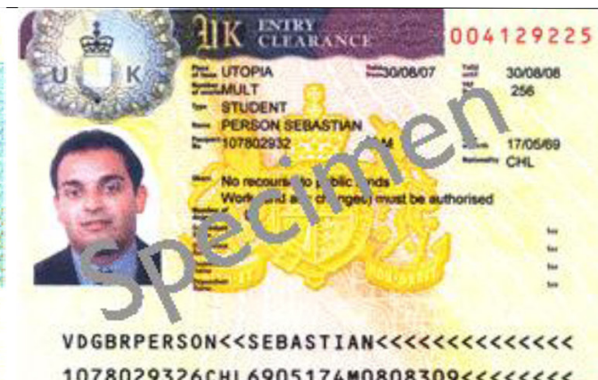
UK Entry Visa