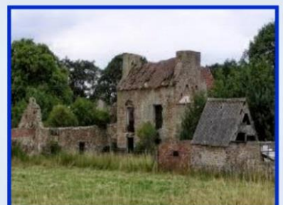
Rural Planning Matters