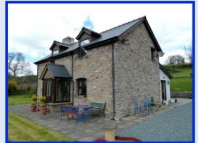
Town & Country Property Rentals