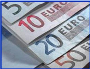
BPS Applications & Entitlement Trading