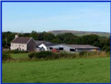
Town & Country Property Sales