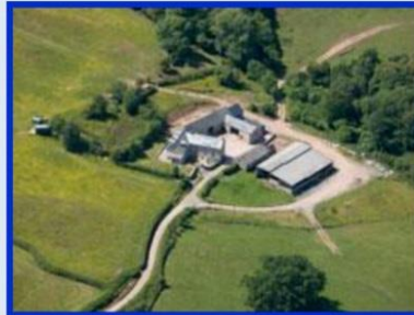
Valuations Including: Secure Lending Probate Expert Witness Inheritance Tax Capital Gains Tax Matrimonial & Partnership Dissolutions Charities Act