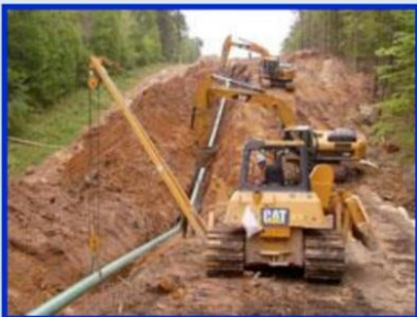
Compulsory Purchase, Land Acquisition and Compensation Matters