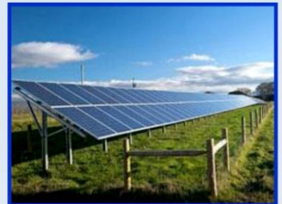
Farm Diversification, Renewable Energy & Feasibility Studies

For more information please contact our team of professionals at your local office: