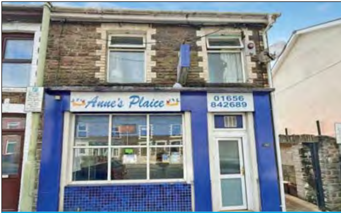
All enquiries: Tel: 029 2059 0899 • Email: auctions@peteralan.co.uk