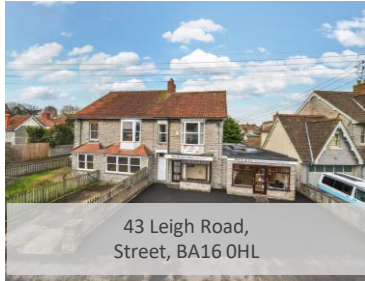
43 Leigh Road, Street, BA16 0HL