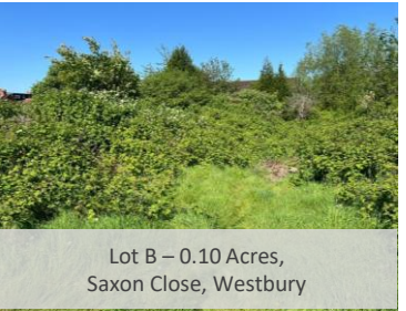
Lot B - 0.10 Acres, Saxon Close, Westbury