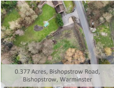
0.377 Acres, Bishopstrow Road, Bishopstrow, Warminster