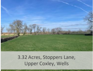
3.32 Acres, Stoppers Lane, Upper Coxley, Wells

Unsold Guide £50,000 to £100,000 inc. VAT