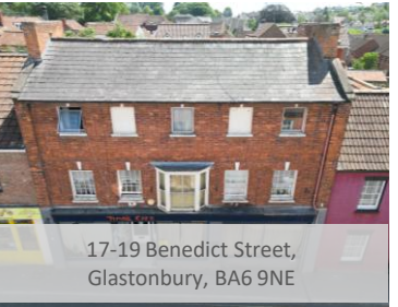
17-19 Benedict Street, Glastonbury, BA6 9NE