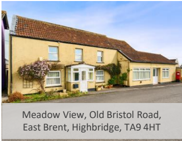
Meadow View, Old Bristol Road, East Brent, Highbridge, TA9 4HT

Withdrawn Guide £300,000 to £325,000,000