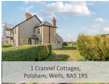
1 Crannel Cottages, Polsham, Wells, BA5 1RS