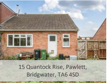
15 Quantock Rise, Pawlett, Bridgwater, TA6 4SD

Sold Post Auction Guide £500,000 to £600,000