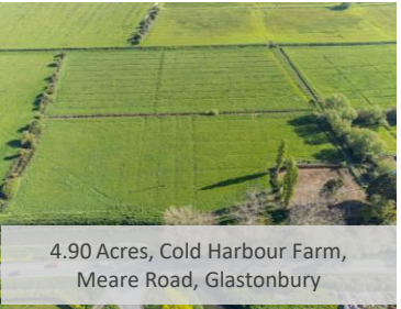
4.90 Acres, Cold Harbour Farm, Meare Road, Glastonbury