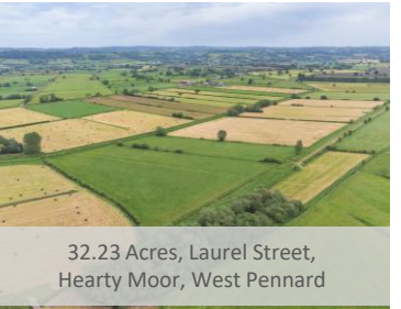
32.23 Acres, Laurel Street, Hearty Moor, West Pennard