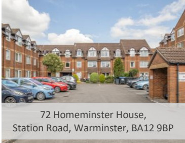
72 Homeminster House, Station Road, Warminster, BA12 9BP