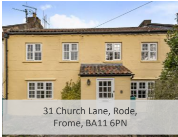
31 Church Lane, Rode, Frome, BA11 6PN