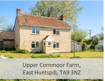
Upper Cornmoor Farm, East Huntspill, TA9 3NZ

Sold Guide £160,000 £120,000 to £160,000