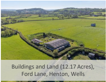
Buildings and Land (12.17 Acres), Ford Lane, Henton, Wells