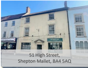
51 High Street, Shepton Mallet, BA4 5AQ

Unsold Guide £50,000 to £100,000 inc. VAT