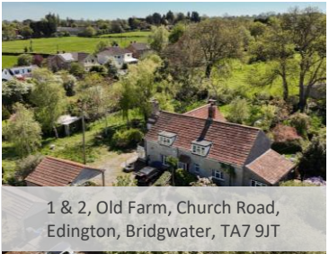
1 & 2, Old Farm, Church Road, Edington, Bridgwater, TA7 9JT

Withdrawn Guide £300,000 to £325,000,000