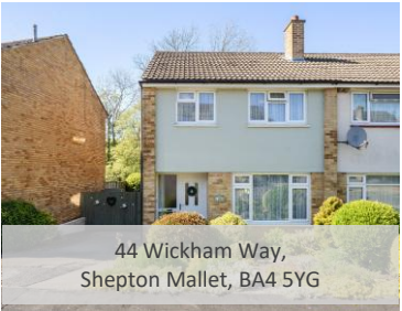
44 Wickham Way, Shepton Mallet, BA4 5YG

Sold Guide £160,000 £120,000 to £160,000