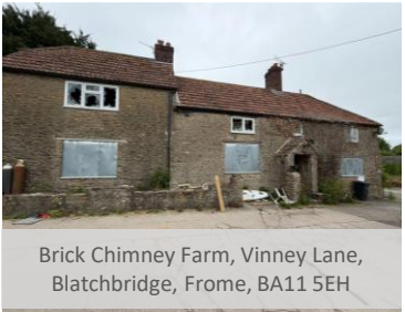
Brick Chimney Farm, Vinney Lane, Blatchbridge, Frome, BA11 5EH

Sold Guide £655,000 £300,000 to £350,000