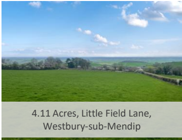
4.11 Acres, Little Field Lane, Westbury-sub-Mendip