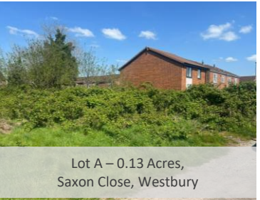
Lot A - 0.13 Acres, Saxon Close, Westbury